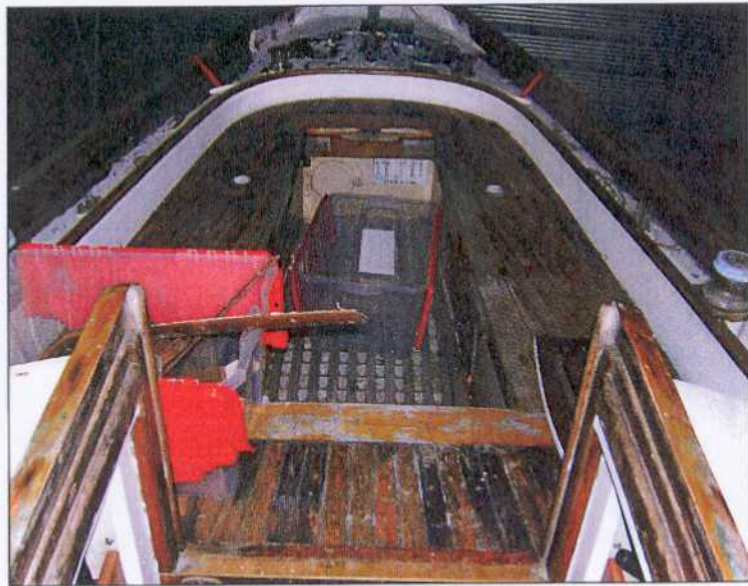
The Laura Ellen was moved to Done-Rite Restorations for repair.