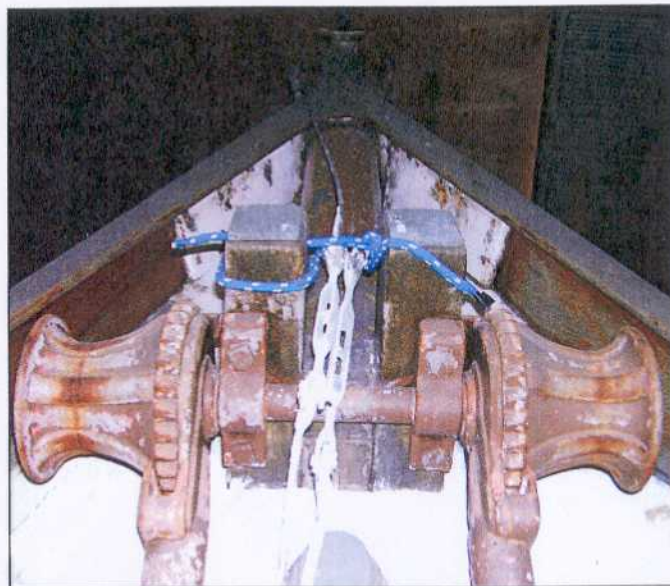
After extensive restoration, this junior Bluenose is expected to be in the water next season.